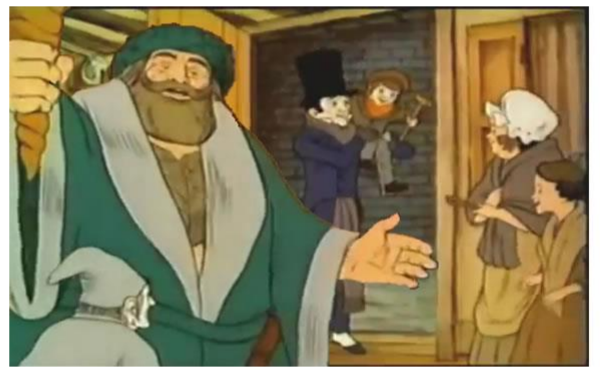
The ghost showed Scrooge Bob Cratchet's family and his crippled son Tiny Tim.